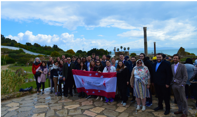
On the left: second semester study trip to Tunisia. On the top: first semester study trip to Ukraine.

We believe that Europe must be learned and understood on the field. Our study trips are designed to provide students with information, encounters, lectures and other academic experiences that cannot be delivered on the campus. In this respect, they represent an irreplaceable added value to the academic programme.